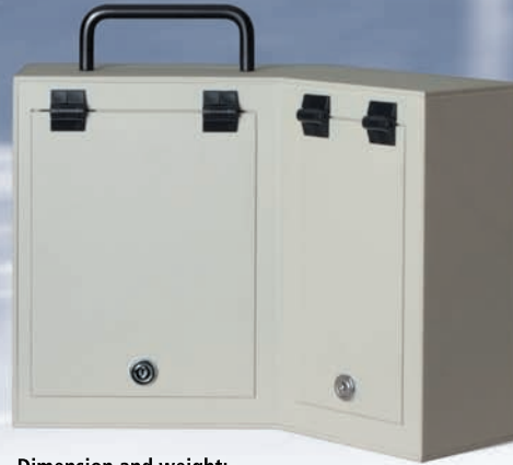
Dimension and weight: 37 x 26 x 23 cm (W x H x D), approx. 3 Kg