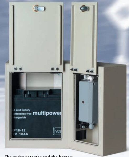
The radar detector and the battery are behind the front lids.