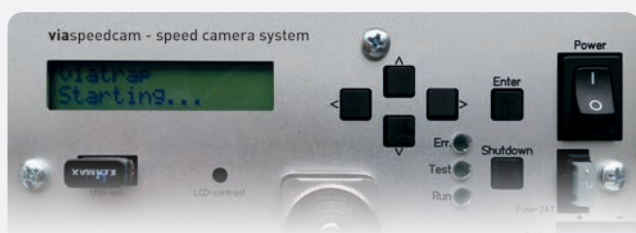
Control panel inside the battery box.

The image sequence shown above, illustrates how the speed violation on your premises can be identified and documented. The viaspeedcam is not generally recording image data, only speeding cars, trucks or fork lifters are logged in the internal memory. The logged data set consists mainly of: a speed value, the location, a time stamp and images of the speeding vehicle.